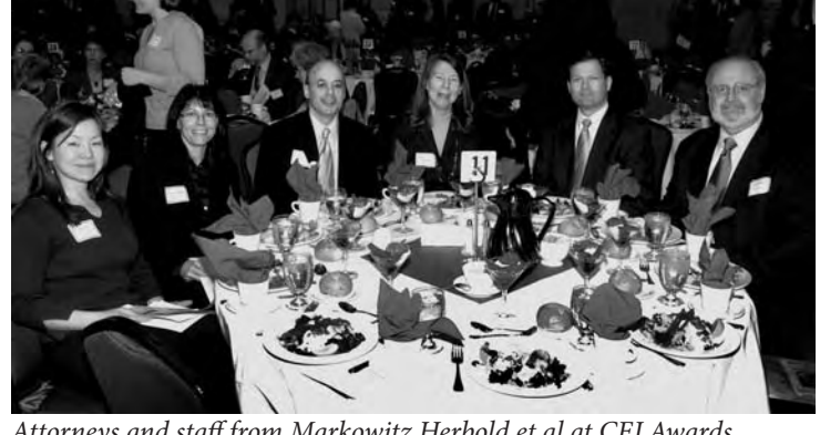
Attorneys and staff from Markowitz Herbold et al at CEJ Awards Luncheon

rspier@spier-mediate.com www.spier-mediate.com