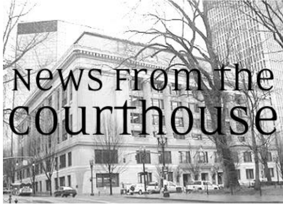
By Susan Watts, Kennedy Watts et al and Court Liaison Committee member.

Another practice tip: After you call civil calendaring to get a judge assigned and a date and time for your motion, you need to file your motion right away. To delay filing the motion is to squeeze the time limits for the other side in responding to your motion and for you in replying to the response. And don't call civil calendaring for a judge assignment until your motion is ready to file.