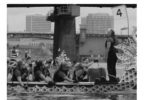
The OWLS DragonFlies team

OWLS is proud to sponsor a dragon boat team, the OWLS DragonFlies, which competes in the annual Rose Festival dragon boat races.