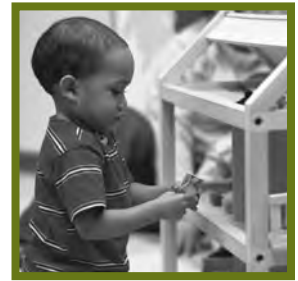
Child in CourtCare's drop-in childcare center

The fund supports the operations of the free drop-in childcare center in the Multnomah County Courthouse, for children between the ages of six weeks and five years and whose parents have business in the courthouse and no other childcare. Since opening its doors in December 2001, over 6,500 young children have used the program. Through the efforts of the MBA and its board, the CourtCare Advisory Board, the MBA Fun Committee, the 2007 “A Jungle Gym in the Jungle” CourtCare fundraising campaign and the generosity of the legal community, over $115,000 was raised this spring for the program’s 2008-09 operating year.