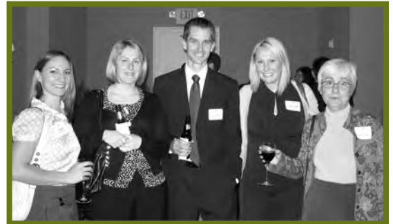
Attendees at the YLS Fundraiser for CourtCare