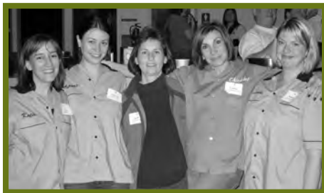
Team members from Legal Northwest at WinterSmash 2008