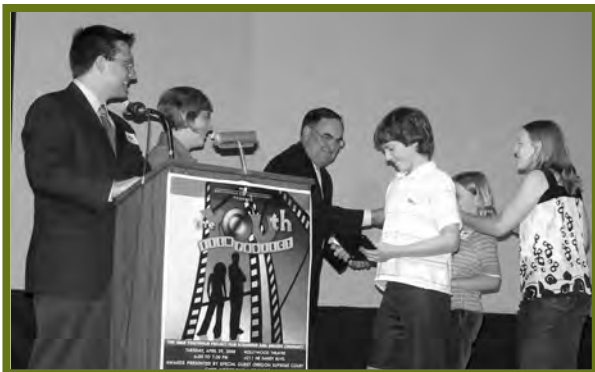
YOUthFILM Project Awards