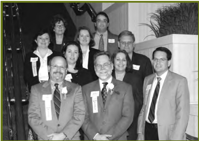
MBA Board. Taken at the May 2008 MBA annual meeting