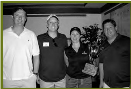
1st Place Low Net Firm team from Perkins Coie