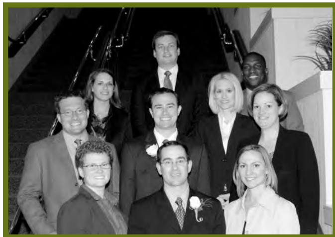
YLS Board. Taken at May 2008 MBA annual meeting